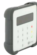
061013 - Dark Grey