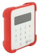
061015 - Red