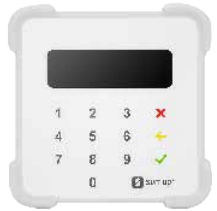
061008 - Grey