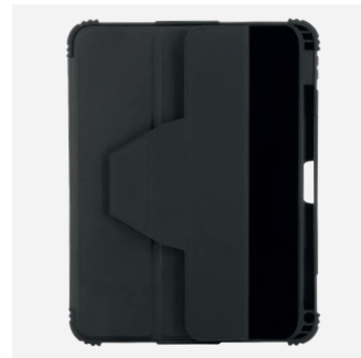
Anti-scratch interior fabric