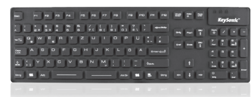
KSK-8030 IN Full-size Silicone keyboard for industrial use