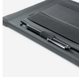
*Stylus not included