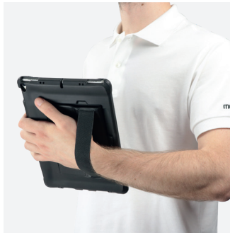
Portrait / Landscape layout